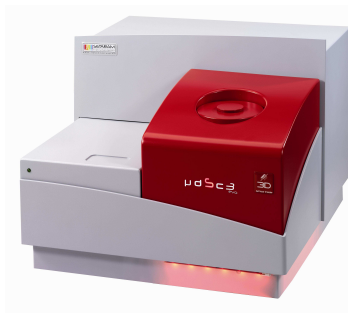
Instrument Micro DSCIII Evo -20°C/120°C